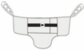
Stand up Slings for a stand aid or patient lifter.